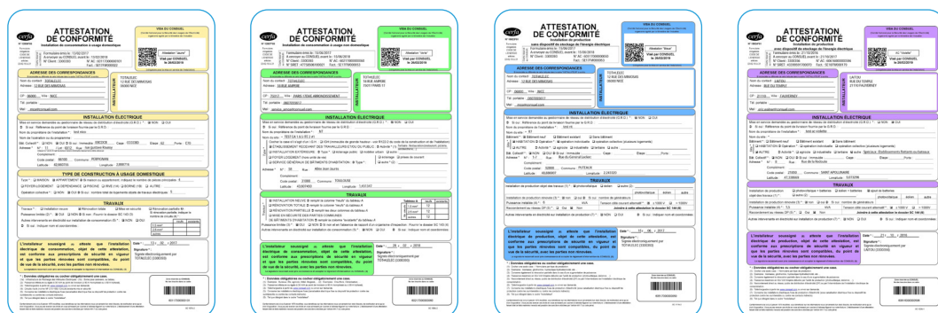
Certificates of conformity for consumption and production facilities